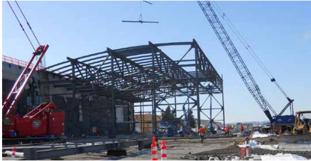
Three Story Office Building