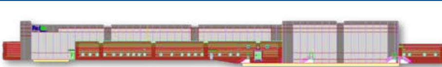
FedEx Ground Project

Owners can move into their new facility knowing they have a building that will meet their needs now and for years to come.