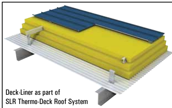
Deck-Liner as part of SLR Thermo-Deck Roof System