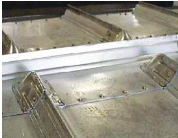
SSR's innovative ridge system and unique panel design provides a long-lasting, weather-resistant roof.